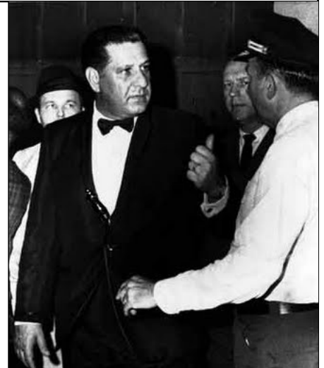
Philly cops have a history of racist violence. Perhaps the most notorious was the reign of terror of Police Commissioner, and later Mayor, Frank Rizzo (above). Rizzo's cops repeatedly assaulted members of the Black Panther Party and the radical MOVE Organization.

cluding 5 children. Police also framed Black journalist Mumia Abu-Jamal for the killing of a cop. Mumia had become a