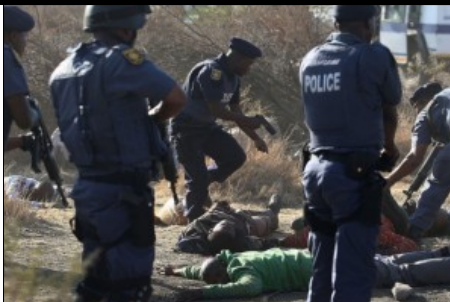
The police massacre in progress, checking the wounded and dead—to finish them off? “The Marikana massacre has exposed the ANC/Alliance “progressive” credentials as bogus”.

On the 8th September Lonmin finally made an offer that was acceptable to the miners. Although they did not get what they demanded, LONMIN was made to offer an 11-22% increase and a one off bonus. Lonmin also had to agree to take back all workers including those who were arrested and charged. Representatives from the ANC and the NUM have condemned the deal.