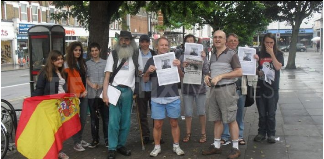
The Counihan Homelessness Campaign In Kilburn Square fighting Brent Council's attempt to drive the family out of Brent