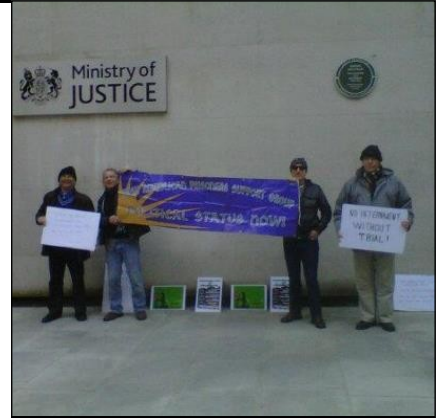
IRPSG members picket the Ministry of Justice on 27 October, the International day of Action for Irish republican political prisoners.

We will continue to resist all attempts by the British government to criminalise us and our