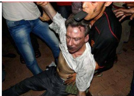
U.S. Ambassador Christopher Stevens suffering the same fate as Gaddafi at the hands of the same barbaric people. Alexander Higgins blog; "Then came revelations of evidence the ambassador was actually captured by the same terrorists he helped put into power who tortured and lynched him and 3 other Americans as Libya security forces stood by and watched."

"In Greece and the whole Europe, it is necessary to paralyze all the ports and ships that transport weaponry and food to murderous al Assad, and instead ship food and weaponry for the heroic Syrian resistance! The Russian and Chinese working class has to revolt against the assassins Putin and Hu Jintao just now! It is urgent to stop the counterrevolutionary war machine of Putin