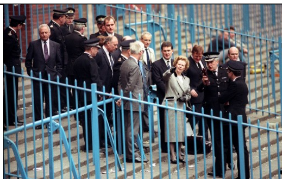
Thatcher at Hillsborough; she bears the main political responsibility from police brutality and arrogance after condoning countless acts of violence during the miners strike.

Hillsborough in a historical context will be seen as a triumph for socialist principles by a predominantly socialist city. A common cause unifying the city and clearing all the obstacles put in front of it. It has been done voluntarily by giants of whom there are too many to mention. The Heroes of Hillsborough numbers thousands. Both Red and Blue who fought together for the result achieved on