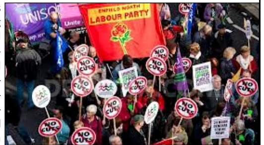
No Cuts: “A clear class line of refusing to vote for cuts and organising the resistance is a key battleground at the LRC national conference on 10 November – without a clear class position of total opposition to making cuts the LRC would be in danger of being reduced to one of the many small magazines such as Tribune which campaign, in a half-hearted way, for a kinder capitalism”.

Founded in 2004 it is grouped around the most class-conscious Member of Parliament, John McDonnell. Given the exodus of many socialists from the Labour Party as a result of the expulsion of small numbers of Militant tendency supporters during the Kinnock and Blair years (and the subsequent decision of Peter Taaffe and a majority of the Militant, now the Socialist Party, to leave Labour) and the revulsion at Tony Blair’s support for the invasion of Iraq the left is a much smaller force than in the heyday of Tony Benn in the 1980s. The LRC is an alli-