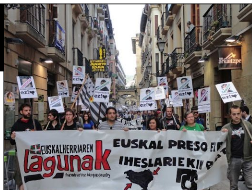
Historically there have been mass popular support for Basques independence, their part in battle against Franco during the Civil War (1936-39) is well known. ETA declared a ceasefire in 2006. Nevertheless a part of the Basque population has continued to demand independence and since the economic crisis support has grown here and in Catalonia. Both regions are economically better off than the rest of Spain.

But after the conversion of the state to "democracy", under Garzon's doctrine that "everything is ETA", youth organisations, cultural organisations, newspapers, radio stations, "people's bars", political parties and platforms of the Abertzale ("patriotic") Left have been banned, usually with members jailed. While ETA is on the EU list of "terrorist" organisations, Batasuna, leading political party of the