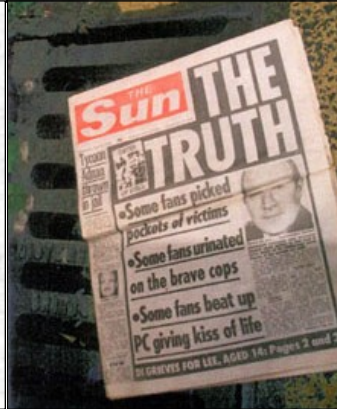
The gutter press slandered the victims to protect the real culprits: the police, the Tories and the capitalist establishment. They all hated the militant Liverpool working class.

[4] Of the 1,874 members of the Liverpool City Police, 954 went on strike. The Bootle police union claimed that 69 out of 70 officers had joined the strike.