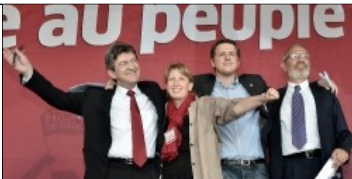
Jean-Luc Mélenchon, on the left, in 22 May 2012, in Strasbourg. "Inside the FdG is the PCF and the mass of these soft leftist people have come from it or have passed through or near it."

That's the man. It can be a very fine tactics or it can be a very nasty opportunistic move. The first can be considered, because no one will call him to the post. No bourgeois would put an outspoken Largo Caballero with pseudo-Keynesian policies in command. It is an inadequate, an impossible policy today in my modest opinion. LO did not go to the demo today with good reasons which are understandable to themselves but which isolated them. I have advocated that they should go and denounce this masquerade before the people. The Treaty is an attack on the workers but Mélenchon is