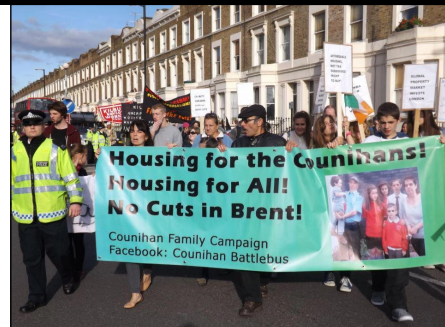
The human face of the 'caring cuts' will speak at the AGM of the Labour Representation Committee on 10 November.

And what will we be arguing on November 10th? We will be saying that the only way to fight these cuts, which will devastate all our lives if we don't, is to form a united front of the solidarity of labour and proclaim the most essential and oldest principle of class solidarity,