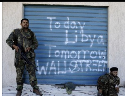
This October 2011 picture is supposed to be proof of the progressive character of the rebels. It is no more proof of anti-imperialism than the lone banner in Benghazi opposing Nato in February 2011 was. And the rebels, like those who promote the picture, seem to be totally unaware that it is Wall Street that has occupied Libya, with their assistance!

Michael says, "In reality the imperialist meddling is no help for the revolutionary-democratic struggle, but threatens to undermine it. That is why we have supported progressive liberation struggles of the masses against dictatorships, but at the same time rejected sharply imperialist