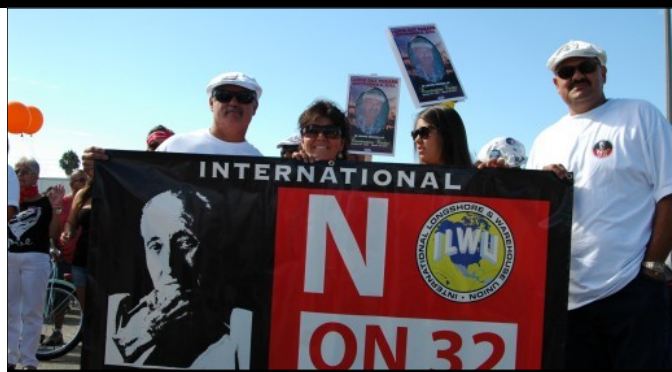
The Obama administration was clearly on the side of the bosses, sending the Coast Guard to protect scab ships from strikers. An alliance of Occupy activists and union members resulted in massive solidarity actions, including the shutdown of the port at Oakland, CA.

Obama's record in office is one of service to Wall Street. Despite the insane ravings of tea party supporters, not only is he not a socialist but he is really not even a liberal. His record shows the hollowness of his appeal to unions and workers. Elected in 2008 on the vague promise of "hope and change," Obama has delivered little for working people.