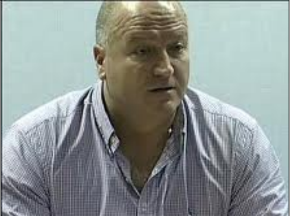
Bob Crow of the RMT can only plead for more TUC demonstrations rather than give us a perspective on how to defeat the anti-Union Laws. "We need to mobilise for the demonstration on 20 th October to ensure it becomes the springboard of the mass movement" he said.

[4] V I LENIN : Left Wing communism, an Infantile Disorder