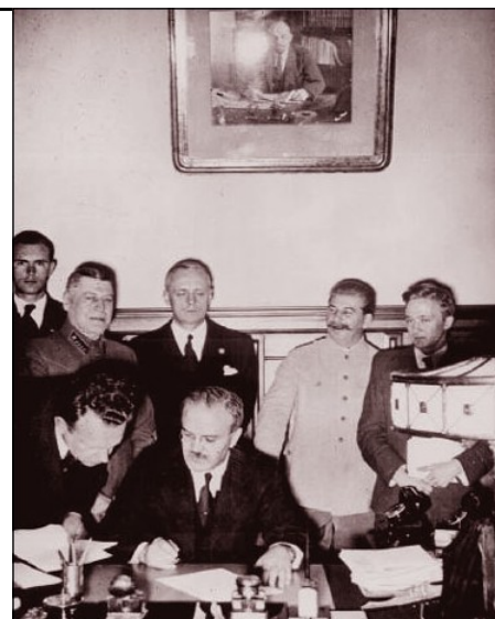
Grover Furr defends the Molotov-Ribbentrop pact of 1939 (above, under Lenin’s portrait!) as a pure Russian chauvinist totally innocent of any revolutionary aspirations — “Thus, all what the Soviet Government actually did, beginning from September 17 on, was in fact the reunification of the Western Belorussian and Western Ukrainian peoples with the majority of their brothers living in the U.S.S.R., and the retrieval of our lands which were wrested by Pilsudski’s Poland in 1920 from our country”. Furr also defends the deportations of many of these ‘peoples’ post war because they had become counter-revolutionaries!

Here too the issue really is line and avoidance of line: