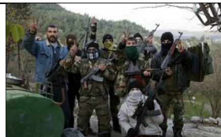
It is a farce to see today the Emir of Qatar and the King of Saudi Arabia standing with Obama, Holland, Cameron and fake 'Trotskyists' leading the struggle for 'democracy'.