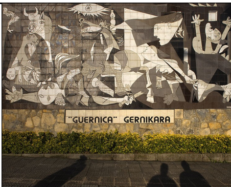
The bombing of Guernica (April 26, 1937) was an aerial attack on the Basque town of Guernica, Spain, causing widespread destruction and civilian deaths, during the Spanish Civil War. The raid by planes of the German Luftwaffe “Condor Legion” and the Italian Fascist Aviazione Legionaria was called Operation Rügen. Basque nationalists advocate that the famous painting by Pablo Picasso be brought to the town, as can be seen in the slogan under this mural in Guernica.

Meanwhile, the larger organisations of the Left, in Europe – excluding the Irish Republican movement – ignore the Basques and their movement. Some require them to merge with the Left in the Spanish and French states, despite the compromised nature of these blocks and of their lack of solidarity with the Basques over the years. Others criticise them for having ambitions of bourgeois nationalism. The disregard is astonishing, in terms of the principles of internationalist solidarity, the degree of repression suffered by the Basque movement, its