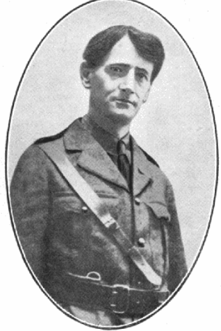
The above image is from PRINCIPLES of FREEDOM , by Terence MacSwiney, published after his death. MacSwiney was Sinn Féin Lord Mayor of Cork during the Tan War.

The Association is particularly keen to get the local trades union council banners present on display at the actual tree planting.