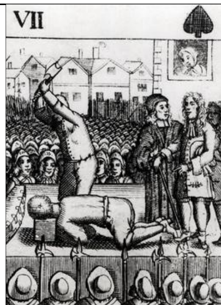
The late D of M beheaded on Tower Hill 15 July 1685

The Counihan Campaign must fight to resolve the immediate problems of homelessness for the family. Hopefully a solution is not far off, certainly the family cannot sustain this level of stress amounting to torture ongoing since