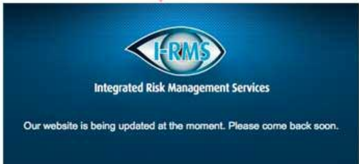
The sequence of changes to the IRSM site that occurred after news of Dwyer's death in Bolivia. First the references to "special services" and "international armed and unarmed security" were removed and then the site was taken off line.