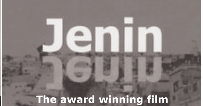
The award winning film

Acclaimed Palestinian actor and director Mohammad Bakri is one Israel's most well-known citizens. He has acted in over a dozen films made by Israeli and international directors including "Hanna K" by Costa-Gavras and is well-known as a stage actor and director. But since producing a documentary ( Jenin, Jenin ) on Israel's 2002 assault on the West Bank town of Jenin, Bakri has found himself virtually blacklisted in Israeli cinema, and now he even faces possible jail time for making the film.